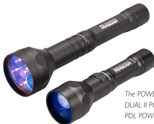
The POWERLIGHT serie: DUAL II POWERLIGHT PDL POWERLIGHT